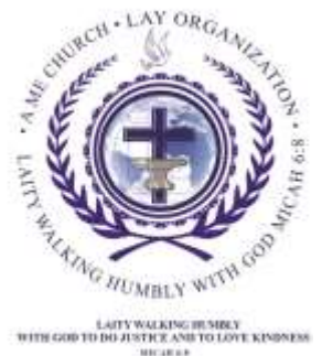
Connectional Lay Organization Logo (adapted 2019-2021)