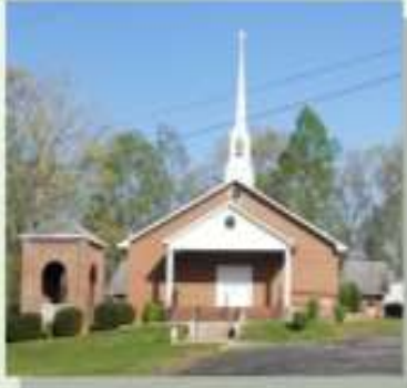
Host Church Shiloh AME Church 1325 N. Powerhouse Rd. Morganton, NC 28655 828. 584. 3962