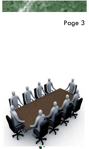
Growing into leadership

Relationally, Jesus calls His disciples to be with Him to allow Him to mentor them. Vocationally, Jesus empowers His disciples by entrusting to them the work and responsibility of minister. Spiritually, Jesus supernaturally empowers these disciples to carry out the work of ministry far beyond their human capacity.