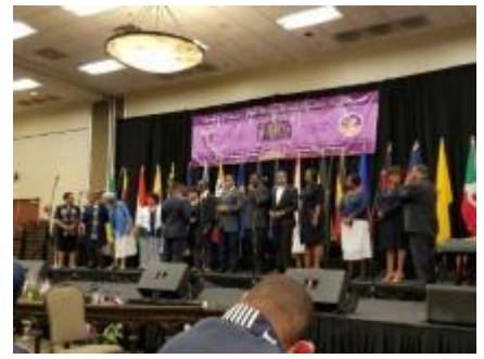
Here are pictures from the WNCC Lay Night program 2016.