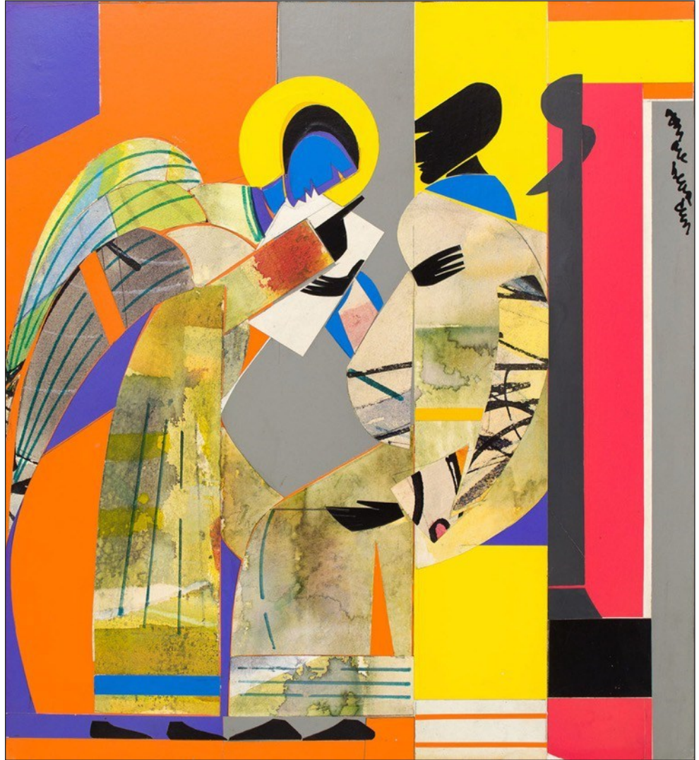
"The Annunciation" Art by Romare Bearden