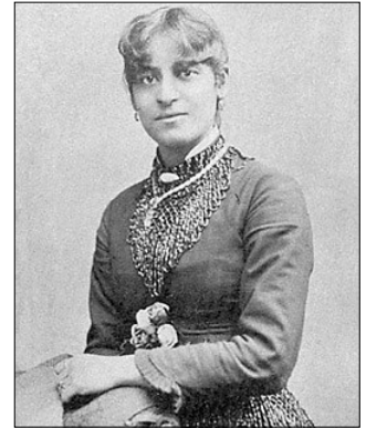
Maggie L. Walker

A. Leon Higginbotham, Jr., becomes the first African American member of the Federal Trade Commission. He was also appointed a federal district judge and U.S. Circuit Judge of the Third Circuit.