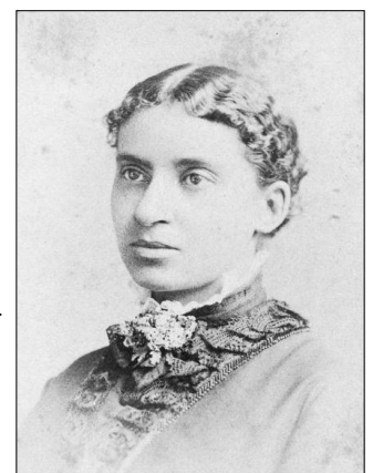
Maria W. Stewart

Maria W. Stewart (1803-1879) addressed the New England Anti-Slavery Society meeting in Boston's Franklin Hall on the evils of slavery and the oppression of free blacks.