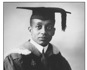
Alain Leroy Locke

Blacks were allowed to enter all branches of the US Military Service, when President Franklin D. Roosevelt signs Selective Service Act.