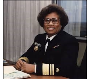
Dr. Joycelyn Elders

Dr. Joycelyn Elders (born Minnie Lee Jones), is nominated to the highest medical office in the land, U.S. Surgeon General, by President Bill Clinton.