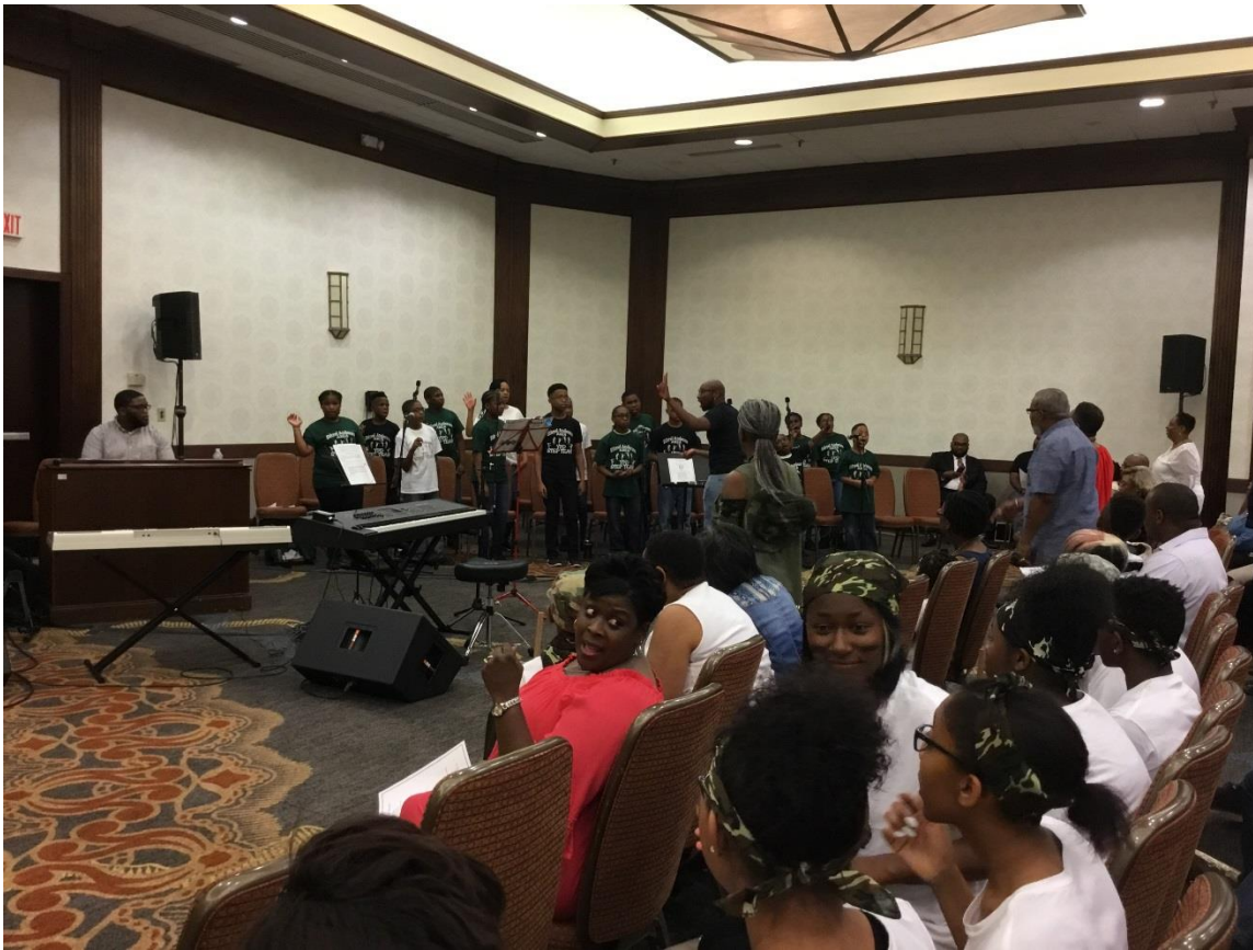
Persimmon Grove singers and Step Team