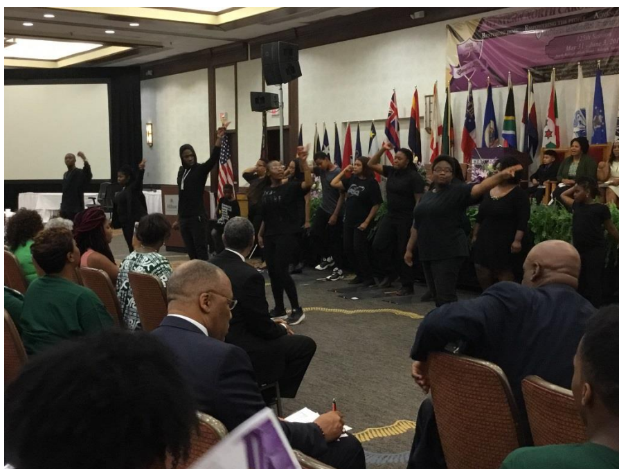
Dancers from Emmanuel AMEC