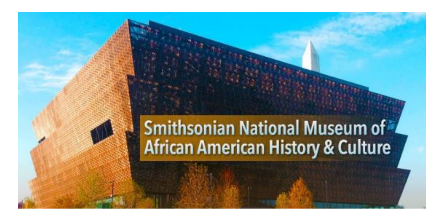
Tonya Jameson submitted this article to Praise 100.9.

nl&utm_source=Sailthru&utm_medium=email&utm_campaign=Daily%20Dynamic%202%202016-12-19&utm_term=Non%20Dormant