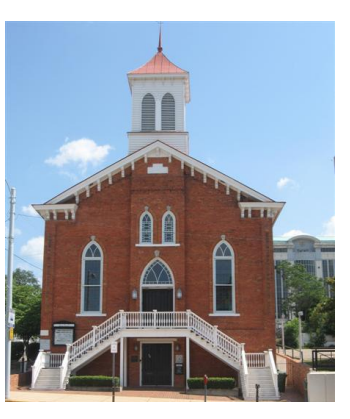
Dexter Ave. Baptist Church Montgomery, Alabama