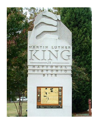
MLK National Historic Site Atlanta, Georgia